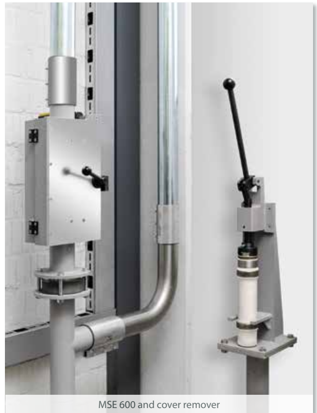
MSE 600 and cover remover