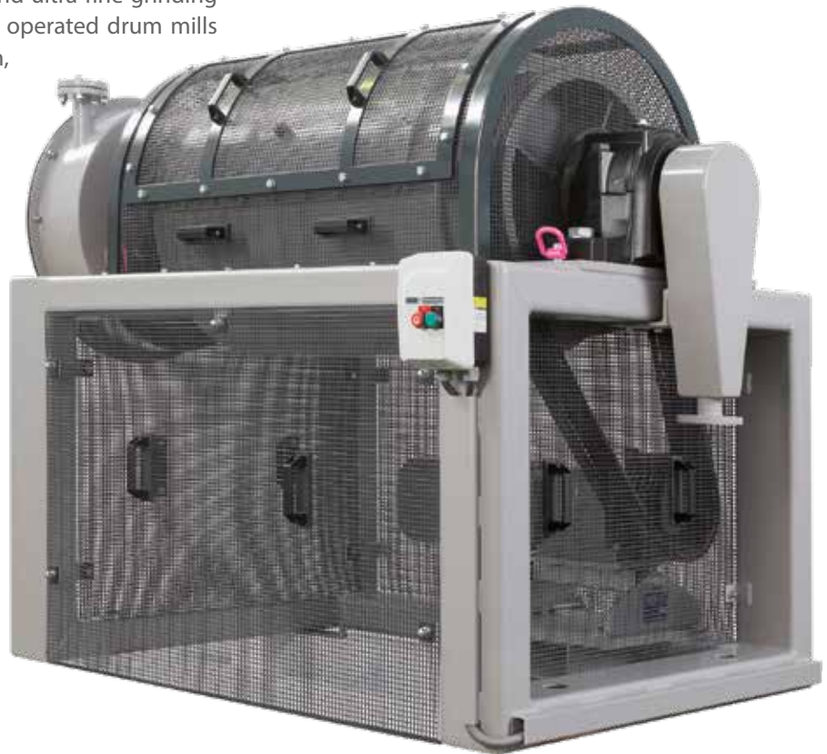
continuous TNS 200 K

The drum mills are used for fine and ultra-fine grinding of brittle materials. Discontinuous operated drum mills make, in addition to size reduction, homogenization of the material to be ground possible.