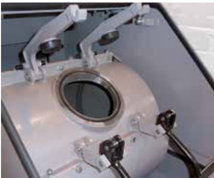
TTS 50 in the filling position with open closure

The drum mills are positioned for filling or emptying in inching operation or via an optional control with automatic positioning.