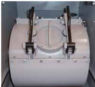
TTS 50 with sealing cover