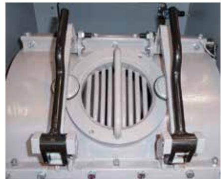
TTS 50 with emptying grid